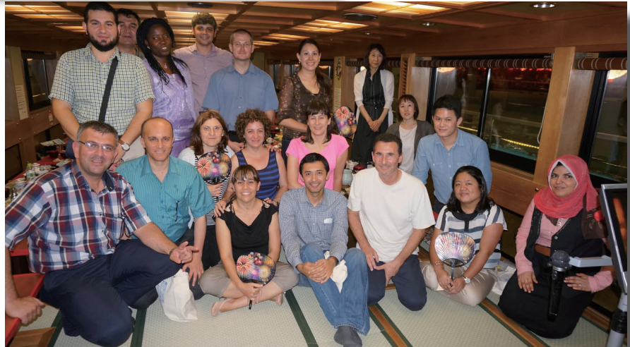
Dinner cruise on a house boat restaurant in Tokyo Bay