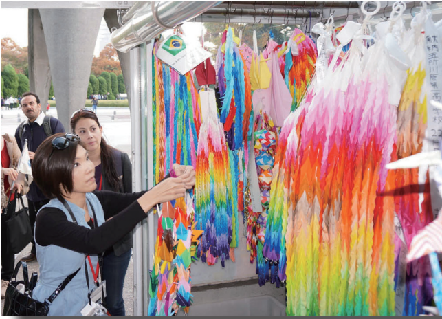
Offer ORIZURU (paper-folded crane) at Peace park, Hiroshima