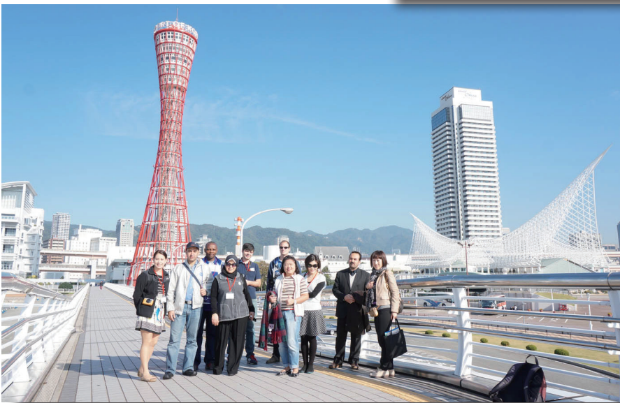
At Kobe Port Tower