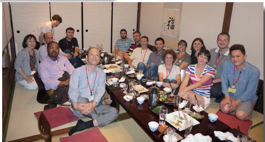
At Japanese Restaurant, in Hiroshima