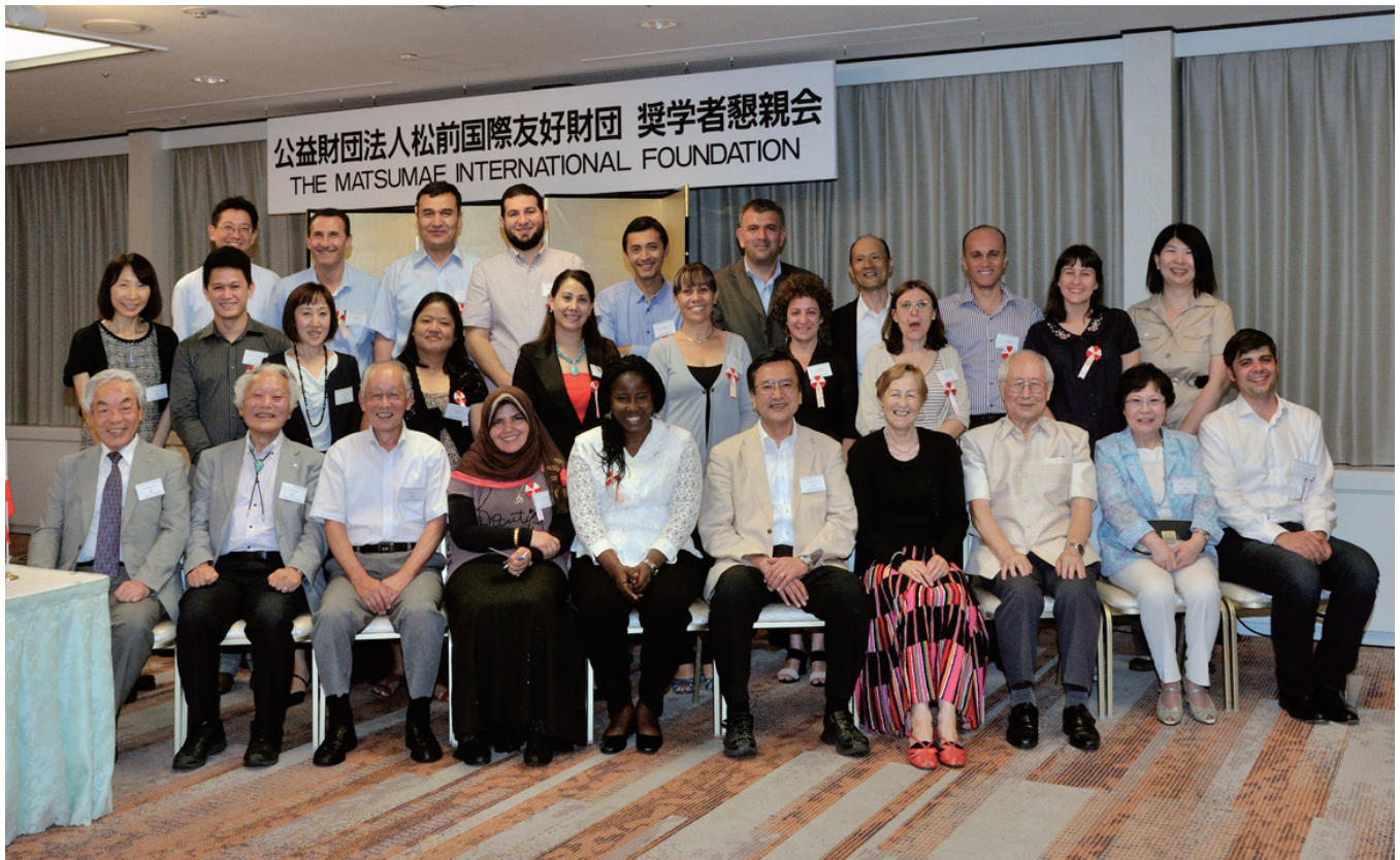
Tokyo Meeting at The Tokai University Club July 11, 2014