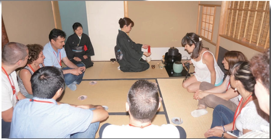
Experience Tea Ceremony. in Kyoto