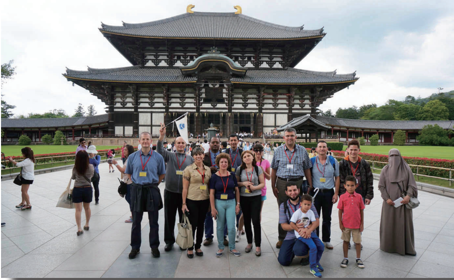
At Todaiji temple, Nara