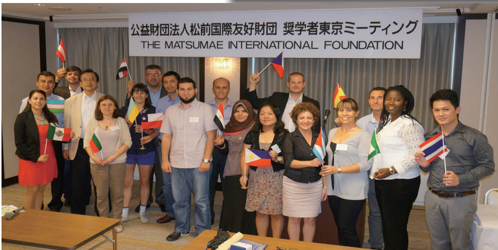
Presentation by participants, at Tokai Univesirty Club 35th floor of the Kasumigaseki Bldg. Tokyo