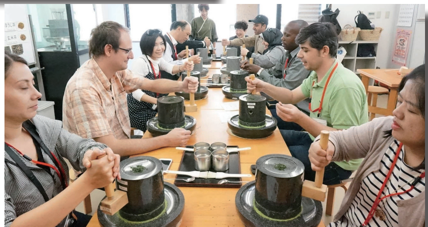
Making green tea powder by stone mill, at Uji, Kyoto