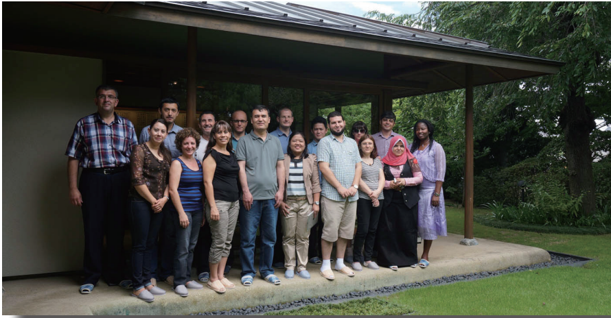
At MIF office garden