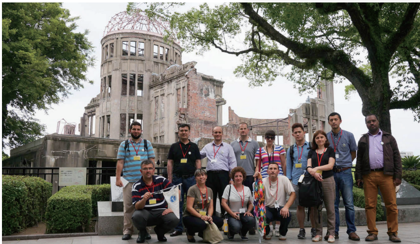
At Peace park, Hiroshima